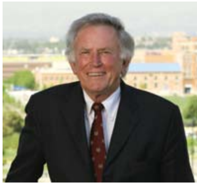
Gary Hart—politics today