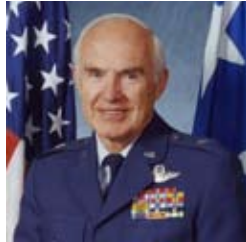
General Phil Caine— WWII air wars