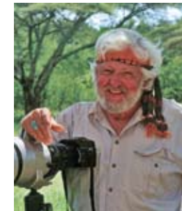
Boyd Norton—Our National Parks